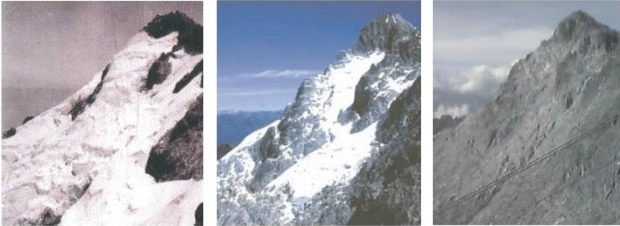
Figure 3. Disappearance of glacier Espejo on Pico Bolivar in Venezuela as documented in photos from 1910 (left), 1988 (middle), and 2008 (right).